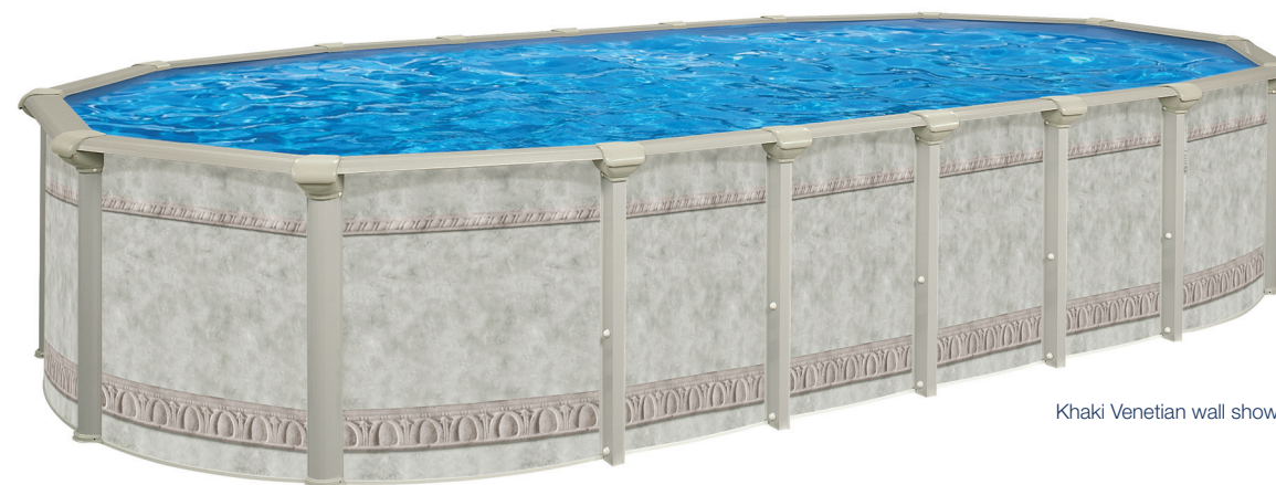
Khaki Venetian wall shown