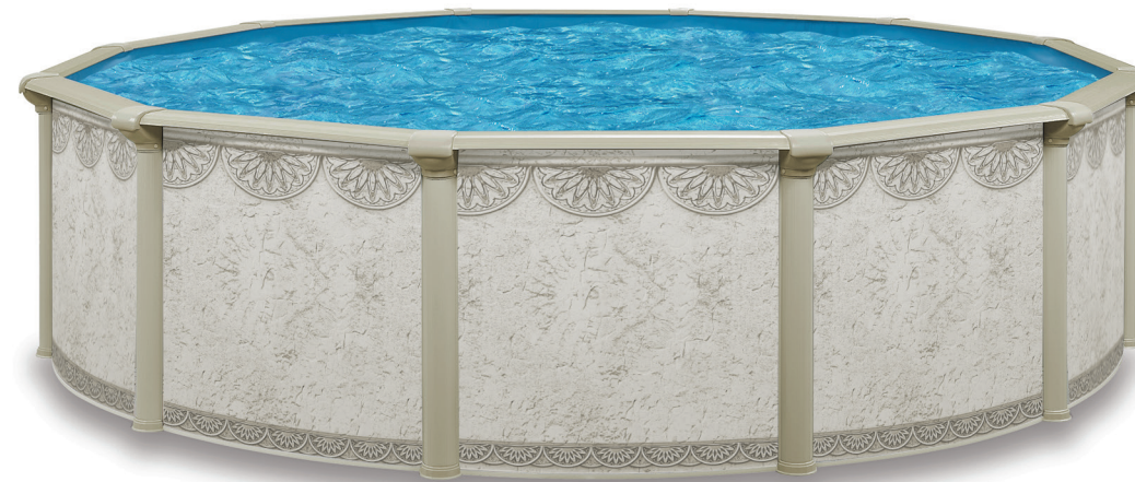
Khaki Maya wall shown